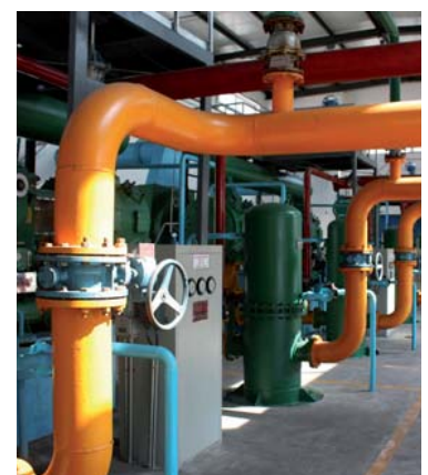
These images have been provided by individuals working with the project partners